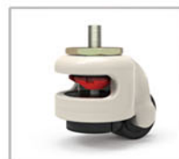
Footmaster Caster Universal caster with brake and leveling feet