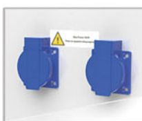
Waterproof Socket 2 waterproof sockets are located in the side wall, for optimum convenience of using small devices inside the cabinet.