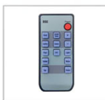
Remote Control All functions can be realized with it, making the operation much easier and more convenient.