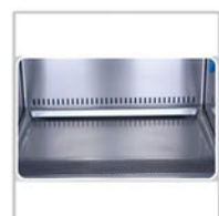
Work Zone Work zone, made of 304 stainless steel, is surrounded by negative pressure.