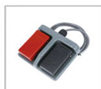
Foot Switch Adjust front window height by foot during experiment, to avoid airflow turbulence caused by arm movement.