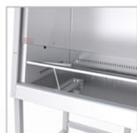
Worktop Holder Usage Diagram